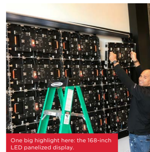
One big highlight here: the 168-inch LED panelized display.

THIS SHOWROOM FEATURES EVERYTHING FROM A MASSIVE MAN CAVE TO "SMART SENSORS" THAT CAN SHUT OFF A HOME'S WATER SHOULD A LEAK BE DETECTED.