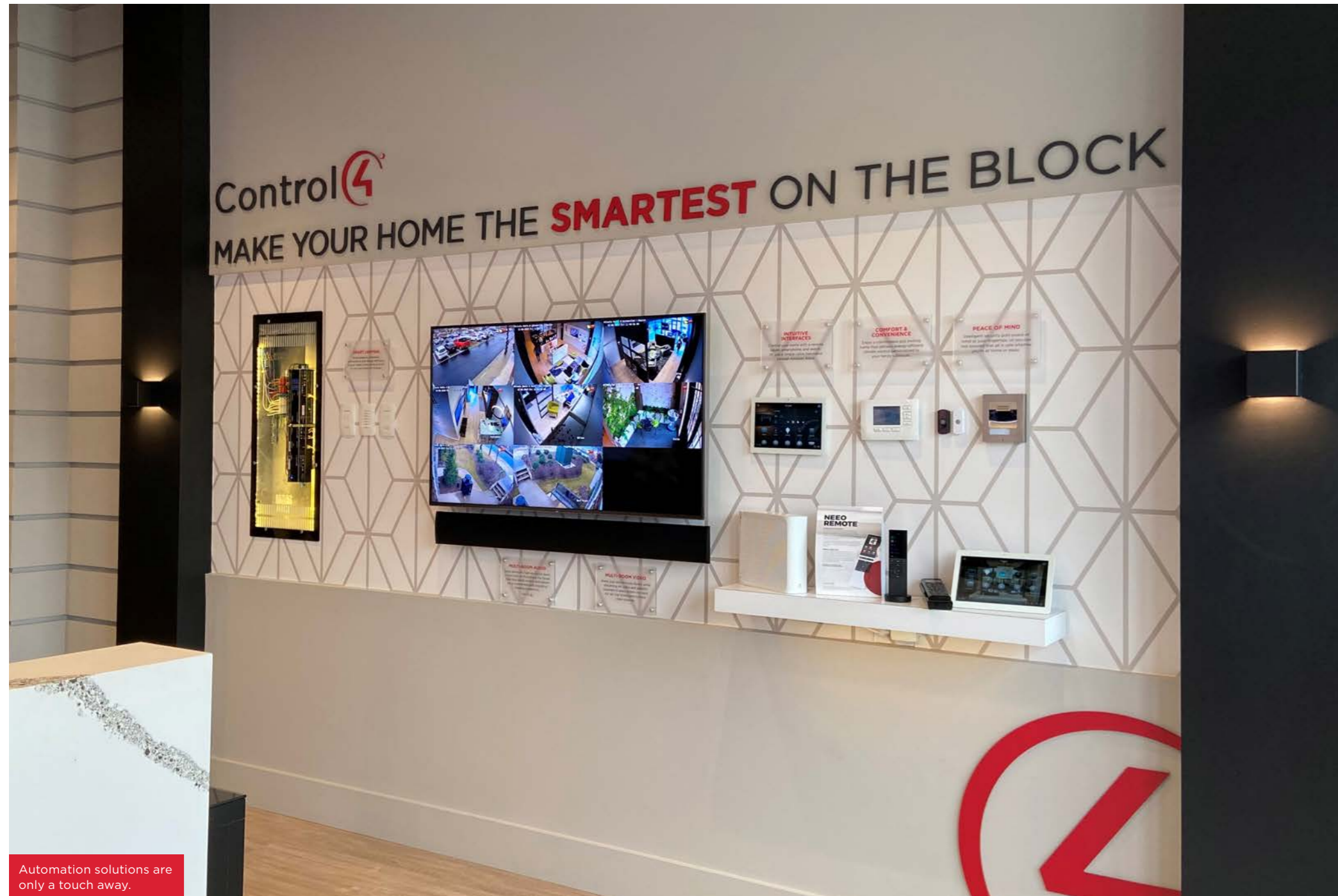
Automation solutions are only a touch away.